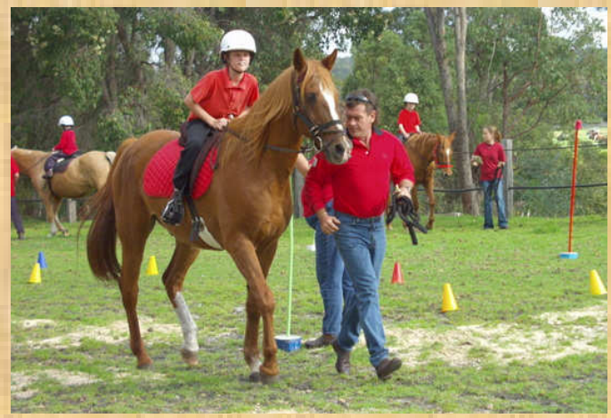
Riding for the Disabled Association of Australia Limited & Pony Club Australia working together to create opportunity

Creating Opportunities Nationally through Networks in Education, Classification